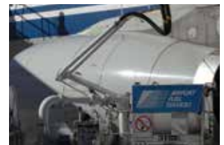
VOLATILE FUEL PRICES